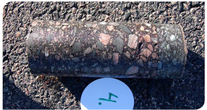
Core sample taken from the runway pavement used in the ITSM test

16 years later, cores were taken from the airport pavement and tested under exactly the same conditions as before. The results in figure 1 clearly show the initial gain in ITSM ratio that was obtained and that the same level of enhanced resistance to the elements is still present after all the years in service.